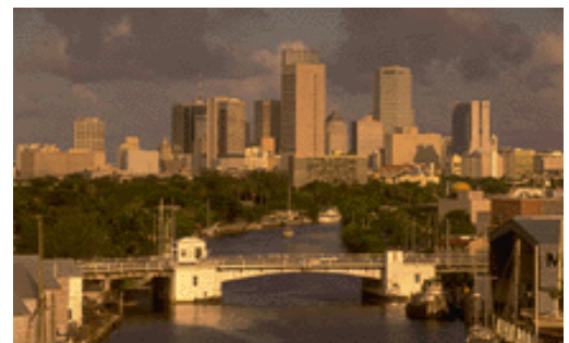
In life do we care whether it is chaos or not?.....

more efficient and effective. In addition, we are in the midst of building a virtual community where like-minded individuals can participate in a language exchange program thereby enhancing the learning experiences in mastering business English / Chinese.